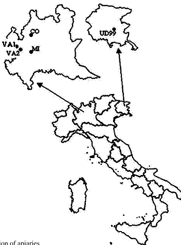
Figure 1. Location of apiaries.

The combs were taken from the hives in September and immediately transferred to the laboratory to collect the mites. The