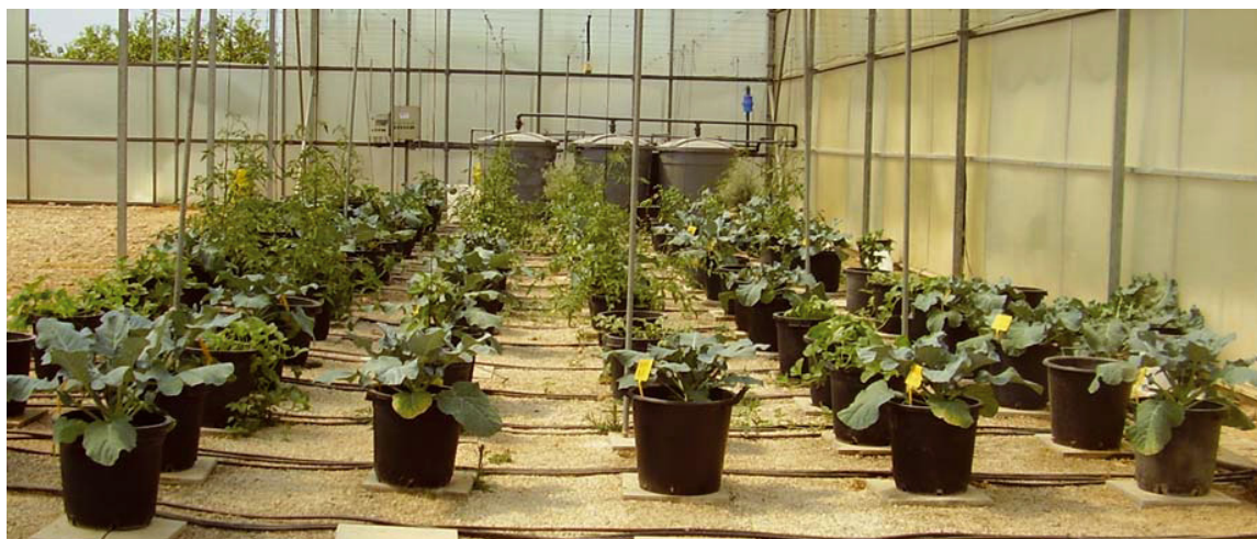
Figure 2. Greenhouse experiment evaluating environmental stresses (salinity and drought) in horticultural crops.

150–450 mg per day over an extended period of time have been associated with poor Cu levels, altered Fe and immune functions, and reduced levels of HDL (Guerrero-Romero and Rodríguez-Morán, 2005; Hamilton et al., 2001).