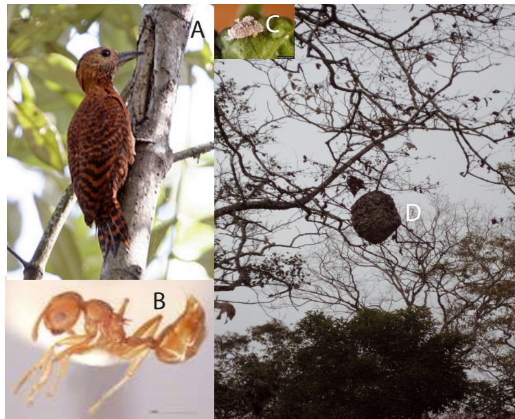
Figure 4. Synergisms between Rufous Woodpeckers, Micropternus brachyurus (A), ants of the genus Crematogaster (B) and plant juices sucking mealybugs, family Pseudococcidae (C), which all reside in the tree-nest (D), made of leaves. (the ant nest-photo, Top Slip, Western Ghats, Kerala, South India, Gero Benckiser; bird-, ant- and mealybug-photos, Wikipedia).

Pseudococcidae , with the medium sized, brown Rufous Woodpecker, Micropternus brachyurus , how agro-ecological management could progress in its development (Vishnudas, 2008). Mealybugs living in moist, warm climates, protected by a secreted powdery wax layer, suck plant juices from a variety of subtropical trees ( Gymnocladus dioicus , Dalbergia latifolia , Aporosa lindleyana , Erythrina indica , Grevillea parallela , Mallotus alba , C. verum , Cinnamomum malabathrum , Olea dioica , Gliricidia indica , Hopea parviflora , Terminalia belarica , Bischofia javanica , Syzygium cumini and Lagestroemia microcarpa ). The ants use the honeydew-producing potential of mealybugs nutritionally and foster and protect them in their paper-wasp-like nests. The plant juice sucking mealybug being supported by Crematogaster ssp. impairs coffee plantations and both considered as pests and killed with pesticides.