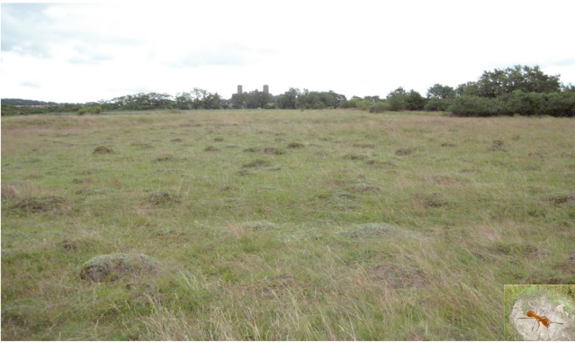
Figure 1. Distribution of Lasius flavus mounds in a meadow near the village Münzenberg, Hesse, Germany.