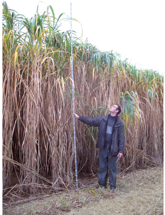
Figure 1. Miscanthus × giganteus during the third year of growth at Estrees-Mons, France.

The cultivation of miscanthus in Europe is mainly based on one species, M. giganteus , which is a natural triploid hybrid between a diploid M. sinensis and a tetraploid M. sacchariflorus (Greef and Deuter, 1993; Linde-Laursen, 1993). M. giganteus production is characterised by low input levels, so that it is a relatively environmentally-friendly crop (Lewandowski et al., 2000). To date, no susceptibility to diseases or pests has been reported by the authorities in the UK (DEFRA, 2007), the European country where the crop is most widely cultivated.