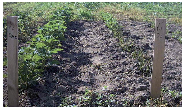
Figure 2. Field resistance of the transgenic line 3 116 of cv. Koral (left) to Colorado potato beetle and leaf defoliation caused by the beetle on nontransgenic plants from the same cultivar.

During the second year of field tests the average tuber production from one plant from two replicates was 80–100% higher compared with the tuber production of the control, non-transgenic lines of the respective cultivar (Tab. II). Several lines, such as 3 12 , 3 203 and 3 206 , produced tuber amounts twice as great as that of the control nontransgenic plants (0.84, 0.95 and 0.87 kg, respectively, average yield from 1 plant from 2 replicates versus 0.43 kg for the control), while the tuber production of several other transgenic lines from cv. Bor (4 41 and 4 103 ) was even three to four times higher compared with the control, nontransgenic plants (1.29 and 1.25 kg, respectively, versus 0.26 kg for the control). The severe infestation of the control plots by Colorado potato beetle could be the reason for that difference. In the future, we plan to evaluate the yield