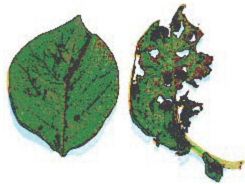
Figure 4. Insect bioassay experiment showing the larvae of the Colorado potato beetle on a leaf from a transgenic plant (line 3 12 of cv. Koral) (left) and on a leaf from a control, nontransgenic plant (right).

All three tested transgenic lines were highly effective against beetle larvae, leading to reduction of Colorado potato beetle populations. Also, the transgenic leaves were almost undamaged, in contrast to the control leaves, which sustained feeding damage. In addition, there was a great difference in weight between the larvae fed on transgenic leaves and those fed on nontransgenic leaves (Fig. 4). Moreover, studies in laboratory conditions carried out with the Bulgarian Bt potato cultivars described in this paper have shown that the cry3A expression has had no negative effect on aphid Myzus persicae development and reproduction (Kalushkov et al., 2006). It has been reported that the Bt Cry3A toxin is highly specific to