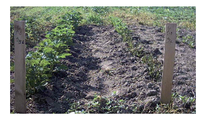
Figure 2. Field resistance of the transgenic line 3_{116} of cv. Koral (left) to Colorado potato beetle and leaf defoliation caused by the beetle on nontransgenic plants from the same cultivar.

During the second year of field tests the average tuber production from one plant from two replicates was 80–100% higher compared with the tuber production of the control, nontransgenic lines of the respective cultivar (Tab. II). Several lines, such as 3_{12} , 3_{203} and 3_{206} , produced tuber amounts twice as great as that of the control nontransgenic plants (0.84, 0.95 and 0.87 kg, respectively, average yield from 1 plant from 2 replicates versus 0.43 kg for the control), while the tuber production of several other transgenic lines from cv. Bor ( 4_{41} and 4_{103} ) was even three to four times higher compared with the control, nontransgenic plants (1.29 and 1.25 kg, respectively, versus 0.26 kg for the control). The severe infestation of the control plots by Colorado potato beetle could be the reason for that difference. In the future, we plan to evaluate the yield