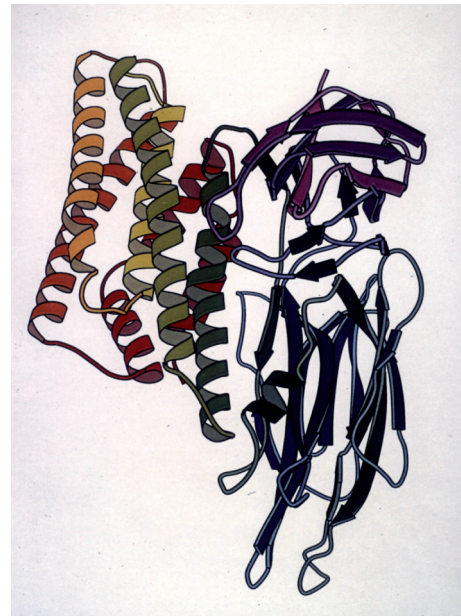
Figure 2. Three-dimensional structure of activated Cry3Aa toxin. Schematic diagram showing the three domains of the protein.

tors and this binding is followed by proteolysis, resulting in a conformational change facilitating toxin oligomerization. The resulting oligomers have a higher affinity for the aminopeptidase N-type receptor, and probably for other glycolipid or