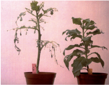
Figure 3. Transgenic tobacco transformed with the cry1C gene. On the left, an untransformed control plant. On the right, tobacco transformed with the cry1C gene, modified for expression in plants. In both cases, 40 Spodoptera littoralis second instars were placed on the leaves. The photograph shows the damage after 72 hours.

(521 000 ha), the western spruce budworm, Choristoneura occidentalis (Free.) (547 000 ha) and L. dispar (2 435 000 ha). In Canada, between 1980 and 1999, almost 6 million hectares of forest were treated by aerial spraying with products based on Bt . It is also estimated that 1.8 million hectares of forest in Europe (corresponding to about 26% of the area treated) were treated with Bt -based products between 1990 and 1998 (Van Frankenhuyzen, 2000).