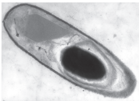
Figure 1. Transmission electron micrograph of a longitudinal section of Bacillus thuringiensis towards the end of sporulation, showing the spore (black ovoid structure) and the protein crystal with insecticidal properties (bipyramidal inclusion).

by the Japanese bacteriologist S. Ishiwata (Ishiwata, 1901). It was subsequently rediscovered in 1911 by the German biologist Berliner, who isolated it from infected chrysalids of the Mediterranean flour moth, Ephestia kuehniella (Zell.), collected from a mill in the province of Thuringe (Berliner, 1915). He called this bacterium Bacillus thuringiensis . Agronomists soon became interested in the entomopathogenic properties of Bt , because small amounts of preparations of this bacterium were sufficient to kill insect larvae rapidly. The first formulation based on Bt was developed in France in 1938, under the name “Sporéine”, but the first well-documented industrial procedure for producing a Bt -based product dates from 1959, with the manufacture of “Bactospéine” under the first French patent for a biopesticide formulation. Commercial formulations of Bt consist of spore/crystal preparations obtained from cultures in fermentors; the preparations are dried and used in a granulated or wettable powder formulation for use as a spray. \delta -endotoxins are highly diverse, resulting in a generally restricted activity spectrum for each individual toxin, and are innocuous to plants, animals and almost all non-target insects (bees, ladybirds and other auxiliary biological control agents) (Marvier et al., 2007). The industrial-scale production of Bt is now well controlled and relatively simple, and is competitive in terms of cost, and this obviously contributes to its success.