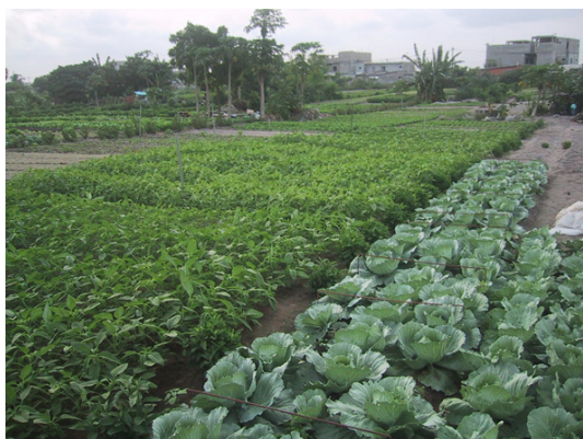
Figure 3. Amaranthus and cabbages are two worldwide leafy vegetables grown in tropical urban and periurban areas, mainly in developing countries due to the high adaptation of some varieties to high temperature and humidity.

refrigerators. These leafy vegetables are mostly brought into town from distances of less than 30 kilometers from the city centers, be it in Africa or in Asia. The urban agriculture origin represents more than 70% of the contributions in all the cities investigated. In Hanoi in 2002, more than 70% of all leafy vegetables came from a production radius of 30 kilometers around the city. Ninety-five to 100% of all lettuce came from less than 20 kilometers away, while 73% to 100% of water convolvulus was harvested less than 10 kilometers from the city (Moustier et al., 2004). In Phnom Penh, urban areas, i.e., those located inside the municipality, supply all of the water convolvulus marketed in the city. This is a vegetable particularly important for consumption by the poor (Sokhen et al., 2004).