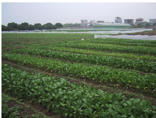
Figure 4. The cultivation of short-cycles leafy vegetables, from 25 to 40 days, as choysum ( Brassica rapa cvg. Choysum ) in Hanoi, is one of the main characteristics of the urban and peri-urban production.

agriculture. These include the forum in Harare in 2003 attended by local governments from Kenya, Malawi, Swaziland, Tanzania and Zimbabwe, and the Quito declaration signed in 2000 by city mayors from 22 countries in Latin America and the Caribbean (Veenhuizen, 2006).