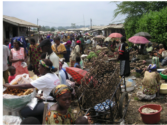
Figure 1. The informal sector accounted for more than half of the gross domestic product (GDP) of Cameroon. In agriculture industry, it includes agricultural production activities as well as marketing of agricultural products as in Muea next to Douala.

Urban agriculture is one of the traditional activities conducted by African households as a risk-sharing strategy, but also as a significant part of their culture and tradition of urban gardening. As stated by Page (2002) in the case of Cameroon: “Far from being a technical practice, urban agriculture has often been a culturally and politically important aspect of urbanism in Africa”. Urban growth and the consecutive structural changes in landscape and livelihoods affect urban agriculture. In Africa, the institutional interactions between the ministries of Agriculture and the ministries of Urban Planning often turn