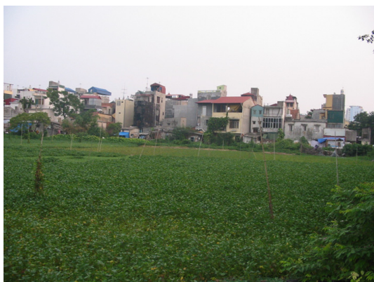
Figure 2. The freshness of urban leafy vegetables, as water convulvulus ( I. aquatica ) in ponds in inner districts of Hanoi, is one the reason of their cultivation in urban area.