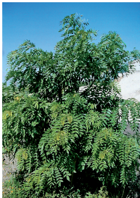
Figure 1. Mata-raton ( Gliricidia sepium Jacquin), approximately three years old.

Twenty mature neem ( A. indica ) and 20 mata-raton ( G. sepium ) trees were selected at random in the South-East