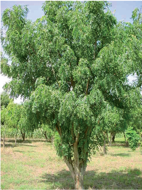
Figure 2. Neem ( Azadirachta indica A. Juss.), approximately 15 years old.

and as such three soil samples were obtained. The soil from each plot was passed separately through a five-mm sieve and characterized. The soil, with pH 6.6 and water-holding capacity of 380 g kg -1 , had an organic C content of 56.8 g kg -1 , an inorganic C content of 2.8 g kg -1 and total N content of 8.9 g kg -1 soil, and a water content of 78 g kg -1 . The particle size distribution of the soil was 50 g clay kg -1 (<0.002 mm), 50 g silt kg -1 (>0.002 mm and <0.05 mm) and 900 g sand kg -1 (>0.05 and < 2 mm).