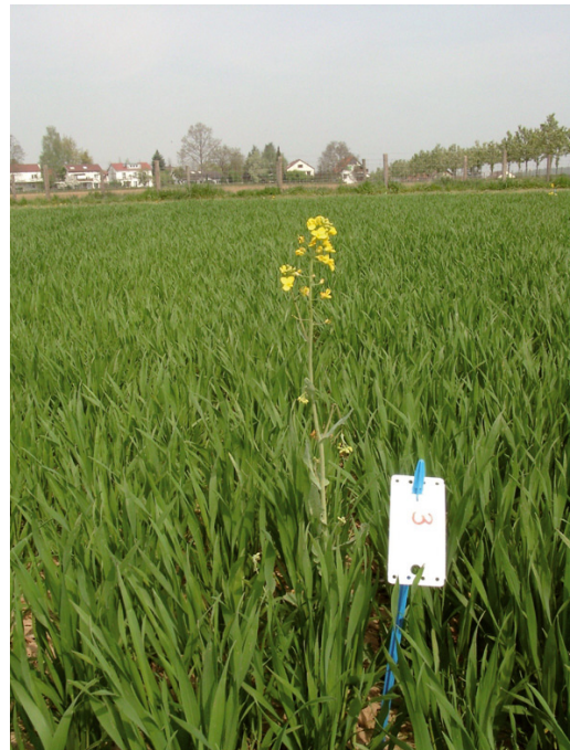
Figure 2. Oilseed rape volunteers in winter wheat.

With HT oilseed rape, the intention is to reduce the number of spraying rounds (Madsen et al., 1999) and the active