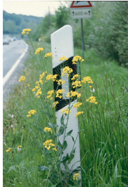
Figure 3. Ruderal oilseed rape on a grass verge next to a country road.

A number of studies have detected changes in the agrobiodiversity as one of the most prominent effects with GMHT