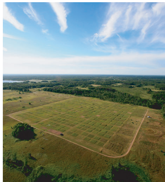
Figure 4. An aerial view of the biodiversity experiment at Cedar Creek Natural History Area in Bethel, Minnesota, USA, reported in Tilman et al. (2006). The 9 \text{ m} \times 9 \text{ m} plots are planted to either 1, 2, 4, 8, or 16 species randomly drawn from a set of native prairie plants. (David Tilman).

The environmental benefits of prairie biofuels are numerous. Unlike maize and soybeans, a prairie requires little or no fertilizer inputs. Nitrogen, which is cycled more efficiently in prairies than in cultivated maize cropland (Brye et al., 2001), can be supplied by native legumes. Phosphorus and other nutrients would need to be supplied only at low levels due to both efficient use in prairie plants and translocation of many elements to root systems late in the season before aboveground biomass is harvested (Fig. 5B). Unlike maize and soybean