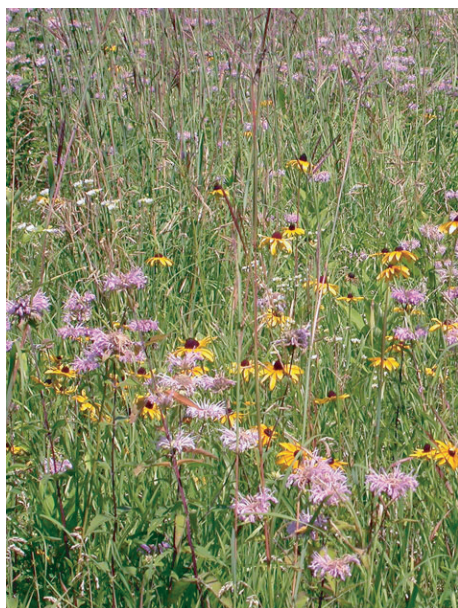
Figure 3. Blackeyed Susan ( Rudbeckia hirta ), wild bergamot ( Monarda fistulosa ), and big bluestem ( Andropogon gerardii ) in a diverse restored prairie in Minnesota, USA. (Clarence Lehman).