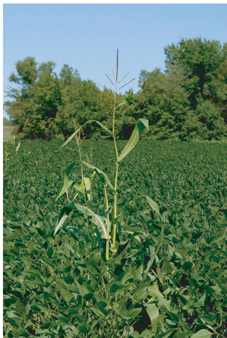
Figure 1. Volunteer maize in a field of soybeans, indicative of the dominant crop rotation in the Midwest US. (Jason Hill).

ethanol, starch from maize kernels is broken down into sugars, which are then fermented and distilled. The remainder of the kernel is commonly processed into distiller's dry grain with solubles (DDGS), which serves as a high-quality animal feed (Spiehs et al., 2002; Lumpkins et al., 2004). The other major US transportation biofuel is soybean ( Glycine max ) biodiesel, which displaces petroleum diesel. In biodiesel production, soybeans are crushed to separate the oils from the meal, which is used primarily as a protein source in animal feed. The oils are then converted to biodiesel and glycerol via a transesterification reaction with the addition of catalysts and alcohol reagents (Van Gerpen, 2005; Haas et al., 2006; Meher et al., 2006).