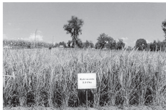
Figure 1. Rice crop in the experimental field.

The present experiment was undertaken at the experimental farm of the institute located in Almora, Uttaranchal, India during the rainy season (June–September) of 2003. The experimental plot was situated in the Indian Himalayas (29° 36' N, 79° 40' E and 1250 m above msl). The soil (0–15 cm) was silty clay loam, acidic (pH 5.9) in reaction, with 0.09 dS m -1 electrical conductivity, 0.8 g kg -1 organic carbon, 414 kg ha -1 available N, 15.8 kg ha -1 available P, 183 kg ha -1 available