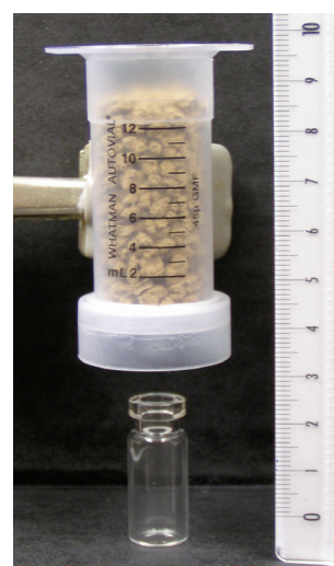
Figure 1. Experimental column (Whatman Autovial®) filled with dry soil aggregates: an autosampler vial can be attached to the tip.

Bentazon (3-isopropyl-1 H -2,1,3-benzothiadiazine-4(3 H )-one-2,2-dioxide) is a weak acid (pKa 3.3) selected for its high water solubility (570 mg·L -1 at pH 7, 22 °C) and its weak adsorption on soil (mean K d value 0.6 cm 3 ·g -1 ) (Huber and Otto, 1994). Specific bentazon adsorptions by the 6 soils studied were previously measured using standard equilibration techniques (Boivin, 2003). Their K d values are reported in Table II.