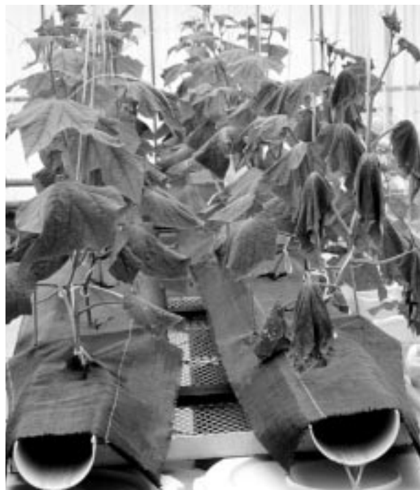
Figure 1. Pythium-infected cucumber plants (right) grown in an NFT recirculating system compared to no Pythium (left).

Over the years, and most intensely in the last decade, various techniques have been studied for their ability to minimize the spread of root pathogens in recirculating nutrient systems. Some of these techniques are now used successfully in commercial greenhouse facilities but others are still unproven or show problems in a commercial setting. They fall into five broadly based categories, namely heat, chemical, and radiation treatments which