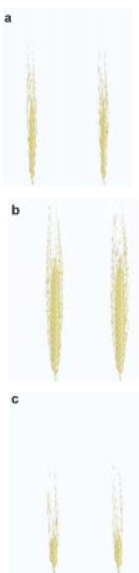
Figure 1. Simulated barley ears. Three parameters (see Tab. II) were varied while all others were set constant. The ears are presented as stereoscopic pairs in order to emphasize that they are not merely flat pictures but 3-D simulations that can be viewed from any angle, and animated.