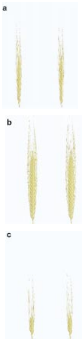
Figure 1. Simulated barley ears. Three parameters (see Tab. II) were varied while all others were set constant. The ears are presented as stereoscopic pairs in order to emphasize that they are not merely flat pictures but 3-D simulations that can be viewed from any angle, and animated.

#if G >= 1 #define M 40 #else #define M 20 #endif.