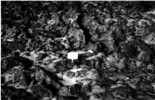
Figure 1. Pictures shown during the experiments covered different texture of soil (i.e. clay loam for pictures 1 and 2, silt loam for picture 3), different friability of soil (i.e. friable for picture 2 and not friable for pictures 1 and 3), different degree of evenness, clods size and soil moisture. Visual signs allowed farmers to infer some variables such as soil moisture.

Transcripts of interviews of every farmer participating in the trial were analysed using a grid (see table III ) establishing correspondences between the expressions used by the farmers to specify the situations they have to deal with, and the variables used by agronomists. When several terms were considered as equivalent, they were associated in the form of sets called attributes (for instance: crusted, slaked down). These attributes were associated in the form of variables (for instance: results of soil textural behaviour). For continuous variables (for instance soil texture) different terms were clustered as a single attribute referring to the order built up from the intervals differentiated by each farmer; thus, terms such as 'clayey loam' and 'very clayey' were associated under the heading 'clayey' which finally grouped the terms corresponding for the farmers to the most clayey of the textures yielded by the set of photographs. Thus we identified the combined variables which farmers use when deciding about the modalities of tilling and sowing. We also identified the variables which would actually lead to the application (or non-application) of the