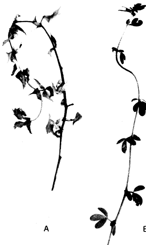
Figure 2 A: Lotus tenuis terminal shoot artificially inoculated. Curling and wilting caused by the anthracnose can be observed ( \times 1 ). B: Control. A: Extrémité d'une tige de Lotus tenuis inoculée artificiellement, montrant l'enroulement et le flétrissement provoqués par l'anthracnose ( \times 1 ). B: Témoin.

Morphobiometric, cultural and pathogenic characteristics of the fungus led to its identification as C. destructivum , anamorph of Glomerella glycines Lehman & Wolf (MANANDHAR et al. , 1986), cited as etiological agent of the anthracnose upon L. tenuis . It causes death of L. tenuis young plants with damping-off