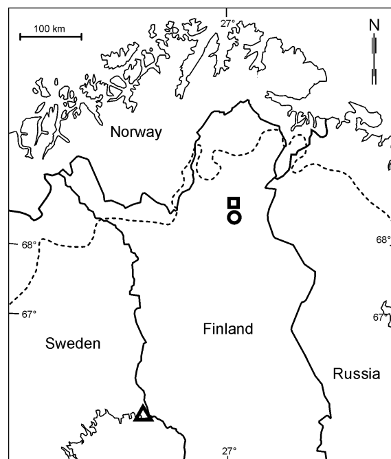
Figure 1. Location of the experimental stands (circle), weather stations (box and triangle), and the northern timberline of Scots pine in Finland.

The height growth of monocyclic pines is predetermined; the growth initials are laid down in the bud in the year preceding the actual elongation (Doak, 1935; Lanner, 1976) and the growing conditions during bud formation largely define the next year's shoot length (Junttila, 1986; Lanner, 1985). Radial growth is affected mainly by the conditions of the current growing season (Hustich, 1948; Jalkanen and Tuovinen, 2001; Mikola, 1950). Therefore, ring width of one year and the next year's height growth are paired variables. The dependence of radial growth on current summer temperature and the dependence of height growth on previous summer temperature at high latitudes are widely known (Hustich, 1948; Jalkanen and Tuovinen, 2001; Junttila and Heide, 1981; Laitakari, 1920; Mikola, 1950; Salminen and Jalkanen, 2005). Radial and height growth define the volume growth and form of the main trunk, and they have been explored in numerous growth and yield studies. Their relationship is also interesting because it reflects the carbon allocation of a tree. Still, the statistical dependence between radial and height growth is less known, and the effect of temperature on both of these growth series has not been studied simultaneously using long time-series mainly due to lack of appropriate height-growth data.