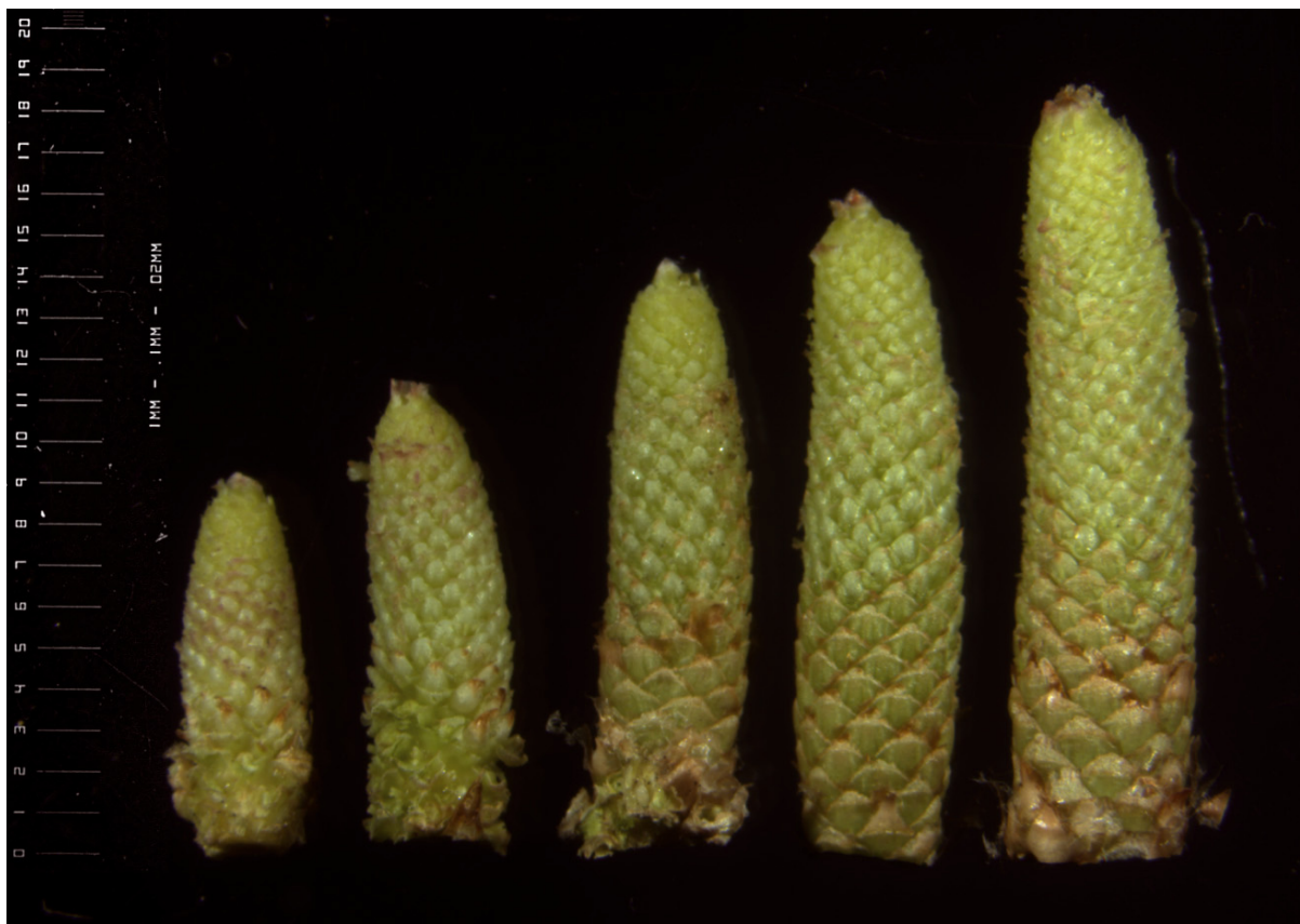
Figure 3. Red pine terminal bud size increased with increasing fall fertilizer rates. Buds represent (from left to right) 0, 11, 22, 44 and 89 kg N ha -1 fertilizer treatments for two-year-old seedlings.

freeze-thaw stress of -196\text{ }^{\circ}\text{C} . However, rapid freezing of red pine needles to -196\text{ }^{\circ}\text{C} (with liquid nitrogen) resulted in over 80% electrolyte leakage.