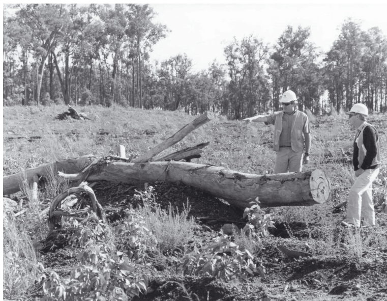
Figure 1. Example of a CWD fauna habitat in a rehabilitated mined area. This rehabilitated area is 1 year old. In the background is a second CWD habitat and unmined jarrah forest.

standards are higher at one CWD habitat per hectare. These habitats are variable in composition and size, and can consist of logs, stumps, rocks and combinations of these. Sometimes they can be a single log. Larger woody material is generally used so as to reduce the probability of loss in a wildfire or controlled burn. Larger logs also have a higher probability of containing hollows used by a range of vertebrate fauna (Williams and Faunt, 1997). Originally, the objective of returning CWD to mined areas was to provide habitat for native vertebrate fauna; however, its importance for a wide range of ecosystem functions has more recently been recognised. The aim of the current study was to determine if CWD in rehabilitated areas had similar arthropod populations and taxa to CWD in unmined jarrah forest areas, and to determine the influence of the age of rehabilitated forest.