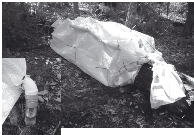
Figure 2. View of an emergence tent around a log, and detail of the collection vial system. This is a 15-year-old rehabilitated mine area.

Whitford et al. (2008) with scores from 0 (not burnt or only minimal burnt patches) to 5 (completely burnt).