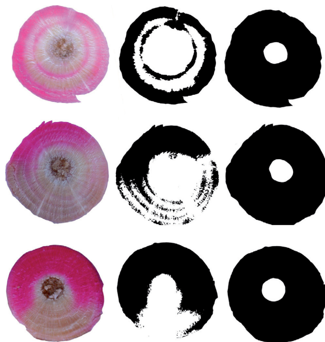
Figure 3. Cross sections of spruce branches stained with phloxine B (left), images obtained by distinguishing stained from unstained wood (centre) and the cross-section minus the pith (right). Percent of stained xylem (PSX) was obtained by dividing the area of the centre by the area of the right hand shapes.

Relative water loss ranged from 6 to 75% in the proximal sections, from 0 to 62% in the central sections that were frozen, and from 20 to 76% in the distal sections of the branch. RWL in the branch sections were highly correlated (Fig. 1), but the slope and offset of the regressions differed significantly ( p < 0.05 , t -test) from 1 and 0, respectively, with RWL on average 5.9 \pm 1.1\% (SE, n = 69 ) higher in distal than in proximal parts of the twigs. RWL in the central section was lower than in both distal and proximal sections, but this may be related to the fact that this section was cut under water, blotted dry, debarked and infiltrated after freezing. The proportion of gas remaining after infiltration ( 0.8 \pm 6.2\% ) was not correlated with PLCv (Pearson r^2 < 0.001 , p = 0.94 ), thus greater water loss had not affected the ability to saturate the samples. In the following analysis, measures of conductivity loss are compared to the RWL in the central section, which was the part used for the conductivity measurements.