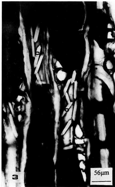
Figure 2. Sieve cell (sc) and sieve areas (arrow) in surface view of a lateral wall (tangential section).