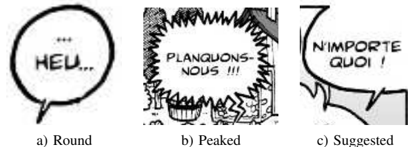
Fig. 1. Example of speech balloons. Image credits [4].

cases, including when contours are implicit, the location of text is generally a good clue to guess where the balloon is. The problem of speech balloon outline detection can therefore be posed as the fitting of a closed contour around text areas, with the distinctiveness that the outline might not be explicitly defined in the image. For the examples given in figure 1, this would be a smooth contour with relatively constant curvature (fig. 1a), an irregular one with high local curvature (fig. 1b), and an implicit one with missing parts (fig. 1c).