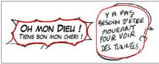
Fig. 4. Example of low resolution contour detection (red line) for closed (left) and open (right) balloons.

the snake by adding new points between the current ones and by changing the weighting parameters of the energy function, and go through a second fitting process. At this stage, we relax the E_{curv} energy to make the snake fit to coarser parts of the boundary and we set E_{cont} strong enough to keep a regular inter-point distance all over the contour. Also, we reduce the E_{text} energy weight because at this step, the snake is already far from text and this term is not informative any more. This new configuration allows the snake to detect more coarse elements as shown in figure 5.