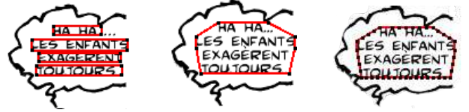
a) Group of text lines b) Text area convex hull c) Snake initialization

The initial number of points impacts the way that the snake moves and the precision of the final detection. During the first low resolution localization step, we perform a spaced equipartition of the points (see fig. 3c) to quickly localize the global shape avoiding unnecessary stops on image details. In the subsequent high resolution fitting stage, we add more intermediate points to fit the exact shape more precisely.