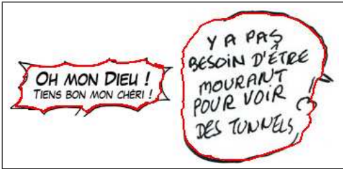
Fig. 5. Example of high resolution contour detection (red line) for closed (left) and open (right) balloons.

the snake by adding new points between the current ones and by changing the weighting parameters of the energy function, and go through a second fitting process. At this stage, we relax the E_{curv} energy to make the snake fit to coarser parts of the boundary and we set E_{cont} strong enough to keep a regular inter-point distance all over the contour. Also, we reduce the E_{text} energy weight because at this step, the snake is already far from text and this term is not informative any more. This new configuration allows the snake to detect more coarse elements as shown in figure 5.