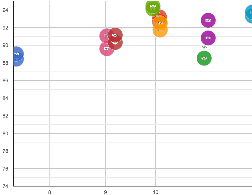
Figure 4: The correlation between the non terminals per sentence ratio and Leaf Accuracy (macro) scores. x : \#non\ terminal / \#sentence ; y : Acc.(%)

compare the performance across annotation schemes, assuming that those subsets are representative of their original source. 42