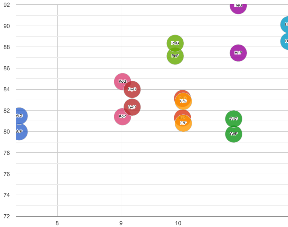
Figure 3: The correlation between the non terminals per sentence ratio and F-scores. x : #non terminal / #sentence ; y : F1 (%)