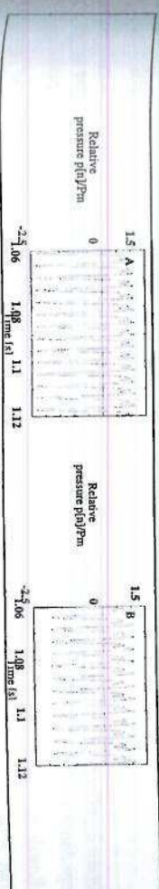
Figure (1a) : simulation results (mouthpiece internal pressure) for the low G fingering of an alto saxophone. The mouth pressure is P_m = 1500 \text{ Pa} , the reed area S_r = 4.10^{-5} \text{ m}^2 . Result A : the input

We present in Figure (1a) the simulation results obtained for the G fingering without modification and the G fingering modified with modification 2. Figure (1b) shows the pressure calculated for the G fingering modified with modification 1. Figure (2) shows the embouchure effects on the resulting discrete pressure signal calculated with the G fingering modified with modification 1 (quasi periodic oscillation). These results show that the simulation process enables obtaining oscillation regimes whose characteristics are very near those observed during the experiment (Dalmont et Gilbert, 1993).