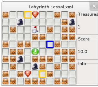
Figure 2: The implemented Wumpus problem. Exit is represented by a flag, start by a coin, walls by bricks, treasures by rubies, traps by policeman’s helmets, monsters by yellow squares, agent location by a blue square.

We developed several solvers for this labyrinth, including a simple random-based action selection model and a naive depth-first search algorithm, but we focus the discussion on two solvers: