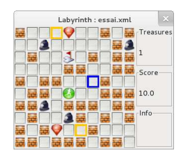
Figure 2: The implemented Wumpus problem. Exit is represented by a flag, start by a coin, walls by bricks, treasures by rubies, traps by policeman's helmets, monsters by yellow squares, agent location by a blue square.

We developed several solvers for this labyrinth, including a simple random-based action selection model and a naive depth-first search algorithm, but we focus the discussion on two solvers: