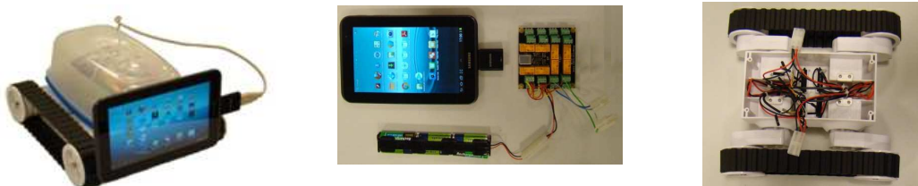
FIG. 2 – The Robot and its entities, the central-unit, the battery pack, the Phidget board, and the mobile platform.

The architecture of the system is composed of several entities, each has a particular task in the super-system.