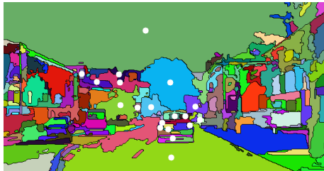
Fig. 2. top-1 tile returned for a given frame by a stream tile mining algorithm for a window size of 500 frames.