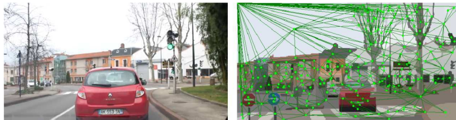
Fig. 1. Frame of a video and its corresponding RAG from a (static) segmentation.