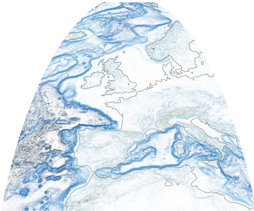
Figure 2. Example of ETOPO1 data downloaded with the marmap package, transformed with the raster package, and plotted with marmap . Orthographic projection, resolution of 10 minutes. R code is available in File S1. doi:10.1371/journal.pone.0073051.g002

marmap was designed to provide easy-to-use tools for importing and using bathymetric and topographic data in R. While marmap has been primarily designed for research, and the rapid production