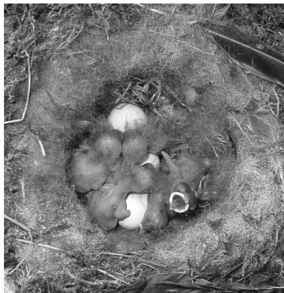
Some of these newly hatched blue tits result from their mother having copulated with a male who is not her partner.