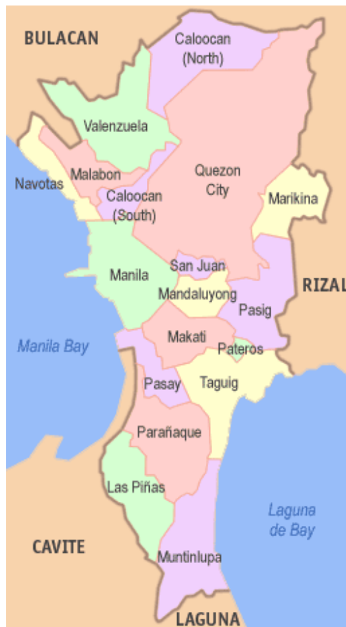
Figure 1: Metro Manila map

Figure 2, compare the rates of modern contraceptive use of women 20 to 45 years old in various cities of the National Capital Region between 1993 and 2008, based on data from the Demographic and Health Surveys. 3 All cities in the National Capital Region, except for Manila, exhibit a clear