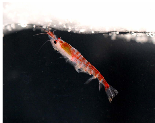
Figure 5. The Antarctic krill Euphausia superba swimming under ice.

The most relevant finding of this study may be related to the evidence for a seasonal pattern of winter low-summer high metabolic rates. This suggests that krill metabolic rates might be driven by endogenous rather than exogenous factors, hence supports previous hypothesis of the existence of a krill internal clock that controls the overall seasonal pattern of krill metabolic activity [27,28]. Brown et al. [4] finally advocate the need for even longer term experiments that would investigate