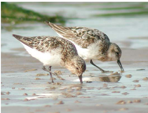
Figure 6. The Sanderling Calidris alba probing in the sand for macrozoobenthos.

Through a thorough survey of the bill measurements available in the literature for the main species of coastal waders in northwestern Europe, Luczak et al. [5] critically discussed the need to include a range of bill lengths in any study meant to assess the macrozoobenthic preys accessible to waders. They discuss the relevance of their sampling device to assess the vertical distribution of macrozoobenthos and their fraction actually available to waders. Luczak et al. [5] also stress that sediment corer can conveniently be used to assess the physical structure of benthic habitats (texture, vertical stratification, mean depth of apparent Redox Potential Discontinuity), hence to build a Benthic Habitat Quality index sensu Nilsson & Rosenberg [31]. As such, their new multilevel sediment corer goes well beyond traditional benthic sampling strategies, and its versatility makes it applicable in virtually any aquatic ecosystem.