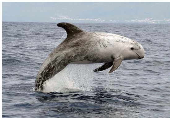
Figure 7. A Risso's dolphin Grampus griseus breaching.

of a network of localities that are important habitats to this species where it may take advantage of prey abundance in shallow waters, as recently suggested for other species, e.g. the Indo-Pacific bottlenose dolphin ( Tursiops aduncus ) in coastal urbanized environments [37].