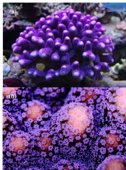
Figure 3. The deep coral Stylophora pistillata , general (a) and close-up (b).

Both the quality and the quantity of light play a critical role in the survival of all photosynthetic organisms in the photic zone [15]. While the exposure of deep-water corals to high UV-B levels in shallower water is usually fatal, Cohen et al. [2] investigate the effect of the PAR/UV-B ratio on the physiological response and the survival of the deep-water coral Stylophora pistillata ( Figure 3 ) through 1) a in situ stepwise, acclimatization of S. pistillata from their original depth (30 m) to shallow waters (3 m), i.e. a progressive decrease in PAR/UV-B ratio, and 2) shaded ex situ incubations of coral fragments from the same colonies under conditions of constant PAR/UV-B ratio. In both experiments, all S. pistillata fragments survived despite drastic changes in both PAR levels and UV-B fluxes between initial and final conditions, i.e. 4- and 140-fold differences in PAR level and UV-B flux. The resulting changes in zooxantellae density, maximum photosynthetic rate, and the quantum yield of PSII led to the conclusion that the oxidative stress caused by UV-B may serve as a signal for corals to enhance acclimation rate while PAR increases. This new aspects of photoac-