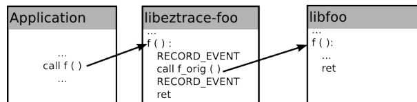
Fig. 1. Instrumentation of the function f with LD_PRELOAD in EZTRACE

To generate a trace, events have to be recorded before and after each call to specified functions. Recording these events permits to keep track of entry and exit of each function of interest. To do so, EZTRACE uses the LD_PRELOAD mechanism that preloads shared libraries before any other shared libraries. As depicted in Figure 1, the symbols provided by a preloaded library take priority over other symbols when the symbol resolution is done. Since EZTRACE defines a function f in a library called libeztrace-foo that is preloaded, when the application calls f , the function defined by EZTRACE is called. This function records an event, then calls the original function f that is defined by the libfoo library. When the original f ends, EZTRACE records another event and returns to the application.