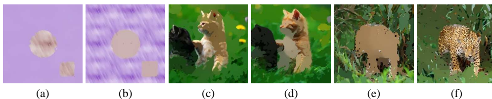
Fig. 2. Experimental results on a synthetic image and on two natural images (selection and filtering of the background in (a) and of the geometric components in (b), selection and filtering of the two cats in (c) and of the background in (d), selection and filtering of the leopard in (e) and of the background in (f) using \mu approach and HSL space.

Since the results give a strong smoothing effect on the outside region while preserving all the details of the inside one, this method gives a straightforward way to perform an object-oriented compression. When considering the ‘‘cats’’ image, a classic JPEG compression with a factor of 0.9 leads to an image of size 25Kb. The same JPEG compression on the filtered image where the two cats are selected and the background is smoothed leads to an image size of 17Kb. So, depending on the size of the region of interest, our filtering method may compress the images with a ratio from 30% to 80% while preserving some selected components. The algorithm can also be used as a pre-processing step for different applications such as segmentation or object selection or even artistic post-production of images or movies.