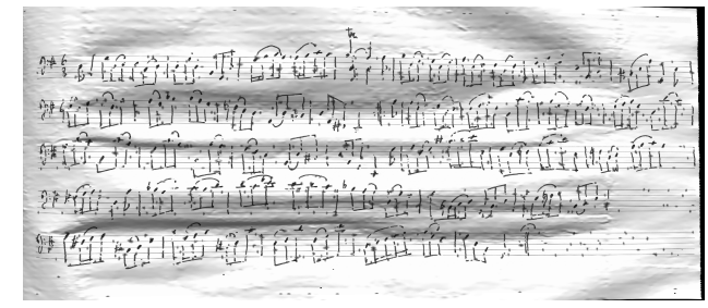
Fig. 3. Two semi-synthetic images from the TrainingSubset3 generated using a high level of local noise and (from left to right) Mesh #1 and Mesh #2