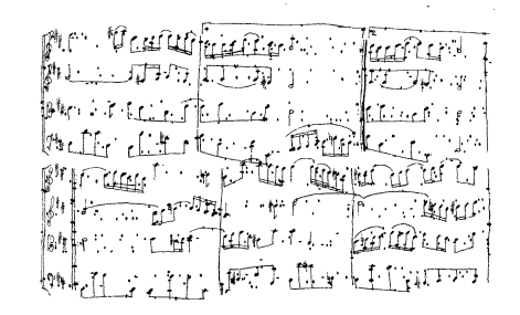
Fig. 4. From left to right: an image from TrainingSubset3, its binary version and its binary staff-less version (ground-truth)