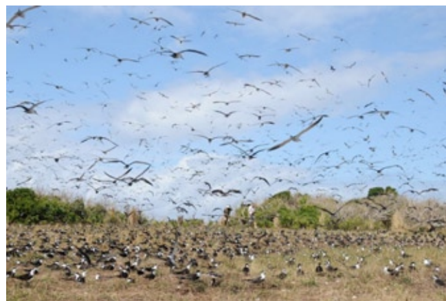
Fig. 2. The two major tern colonies of Madagascar: Crested Terns Thalasseus bergii at Nosy Foty (left) and Sooty Terns Onychoprion fuscata at Nosy Manampaho (right).