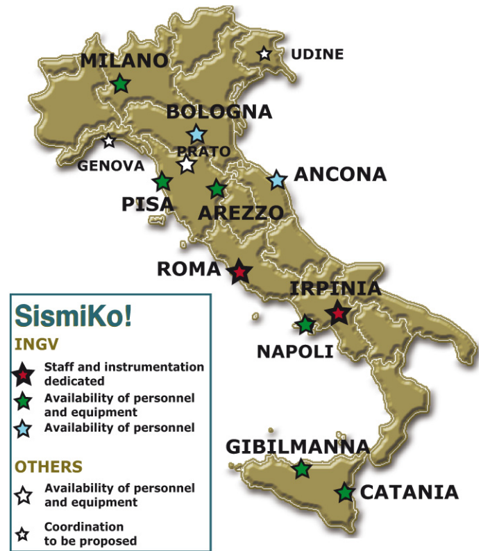
Figure 1. INGV centers in the Italian territory. Differently colored stars, availability of both personnel and instruments or personnel only for emergency network deployments; white stars, other Italian Institutes that generally deploy temporary stations (e.g., Prato Ricerche, OGS and Genova University).

Since 1990, the Istituto Nazionale di Geofisica e Vulcanologia (INGV; National Institute of Geophysics and Volcanology) has had an emergency structure ready to face the occurrence of damaging earthquakes. Temporary seismic networks have been usually deployed for M_L \geq 5.0 crustal earthquakes that have occurred in the Italian territory; these have been important monitoring and scientific tools to better understand the last major seismic sequences (e.g., Carlentini in 1990, Umbria-Marche in 1997-1998, Forlì in 2000 and Molise in 2002). In 2008, a new emergency structure was