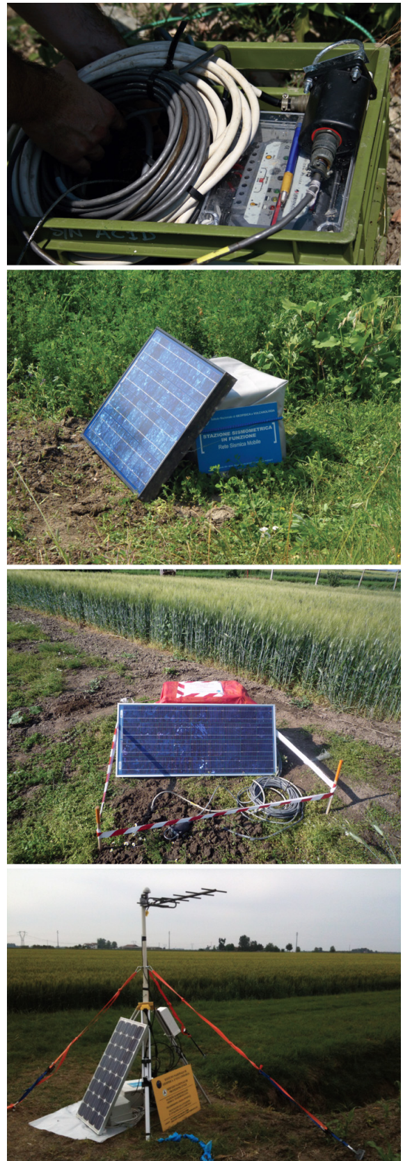
Figure 2. Photographs of the seismic deployments in the Po Plain, showing the standalone recording stations and the stations connected in real-time to the seismic monitoring center in Rome. Top to bottom: the seismic stations (digitizer, GPS, battery and cables) are transported and installed inside a plastic case. The case is covered by a tarpaulin and a sign explains the instrument scope and gives contact information. Most of the stations are powered with solar panels; the sensor is buried inside a plastic bag close to the station. Stations transmitting data in real-time are equipped with antennas.

At the European level, within the framework of the 'Network of European Research Infrastructures for Earthquake Risk Assessment and Mitigation (NERA)' European project, a European Rapid Response Network (ERN) is being developed [Margheriti et al. 2011]. Four European Institutes (INGV, Italy;