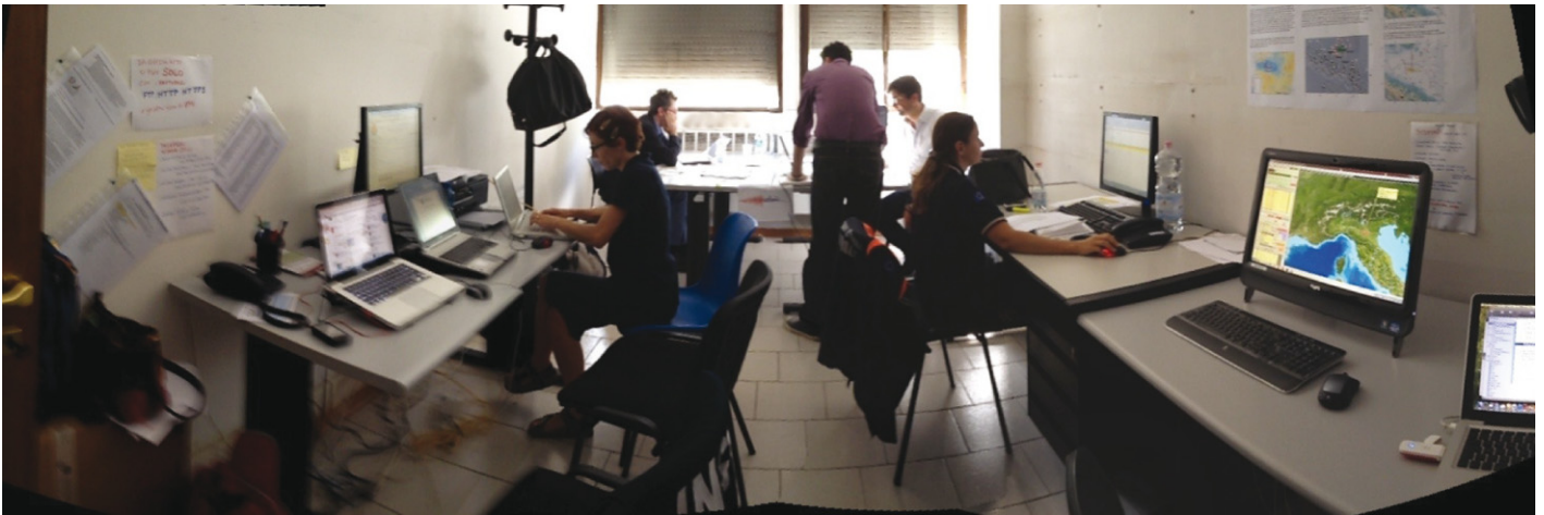
Figure 4. Photograph of the COES room in Bologna.

General Packet Radio Service data transmission to the DPC acquisition center [Zambonelli et al. 2011]. The ca. 50 remaining stations, which were recording as standalone, from the INGV (Re.Mo.-STANDALONE and EMERSITO) and other Institutes (OGS; Università di Ferrara; French IPGS-EOST stations coordinated by INSU, Institut National des Sciences de l'Univers/CNRS) will provide excellent datasets for scientific studies.