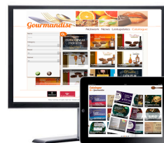
Figure 3. The gourmandise application

Precisely, Ubidreams developed a product catalog (see figure 3) accessible from regular browsers and from iOS devices (as a native application). The feature set differs in the web site and in the iOS application and also depends on the user's roles. The web site offers a management system where authenticated users can add, update and remove products. This part of the application is a business-driven CMS developed for the project. The iOS application focuses on products browsing and viewing.