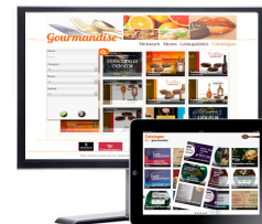
Figure 3. The gourmandise application

Precisely, Ubidreams developed a product catalog (see figure 3) accessible from regular browsers and from iOS devices (as a native application). The feature set differs in the web site and in the iOS application and also depends on the user's roles. The web site offers a management system where authenticated users can add, update and remove products. This part of the application is a business-driven CMS developed for the project. The iOS application focuses on products browsing and viewing.