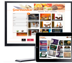
Figure 3. The gourmandise application

Precisely, Ubidreams developed a product catalog (see figure 3) accessible from regular browsers and from iOS devices (as a native application). The feature set differs in the web site and in the iOS application and also depends on the user's roles. The web site offers a management system where authenticated users can add, update and remove products. This part of the application is a business-driven CMS developed for the project. The iOS application focuses on products browsing and viewing.