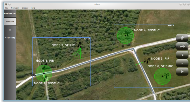
Fig. 1. Diase simulating an intrusion scenario

Sensors are never perfect, if calibrated to detect the smallest event they will be prone to false positives. We choose to model the detection of an event by a sensor using a Bernoulli distribution. When no real intrusion is going on, sensors will have a probability p of wrongly detecting an intrusion and a probability of 1 - p of not detecting one. The experience is repeated every second.