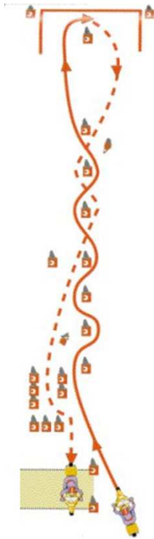
Fig. 4 “Normal speed” handling exercise

modality of learning includes a number of drawbacks. This is not the most efficient method regarding the learning theories; it causes a lack of interest and annoyance for learners, which appear to be unfavourable for learning and their engagement in the training process.