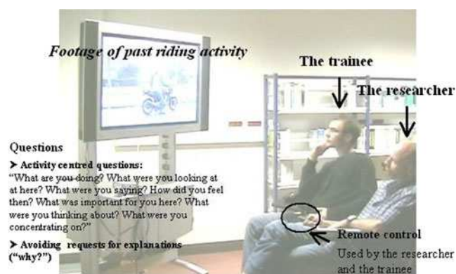
Fig. 1 The self-confrontation interview situation

The instructors were studied 4 months throughout their working days during training on track and training on road (the researcher was located in the following car behind the riders). 36 lessons were observed in detail (72 h) in the case of the first motorcycling school, 48 lessons (96 h) for the