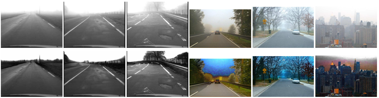
Fig. 4. Result of restoration on camera images. First line, the original image. Second line, the restored image with the proposed MRF based algorithm. The road planar constraint is used only for the 5th first images. Fourth foggy image is courtesy of Audi. Fifth foggy image is courtesy of [8]. Sixth foggy image is courtesy of [5].