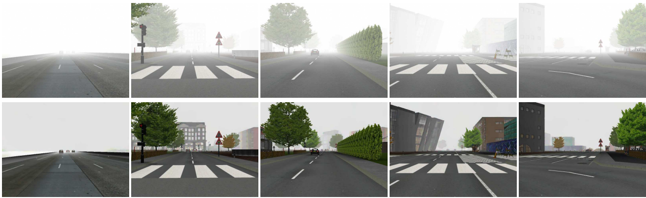
Fig. 3. Defogging results on synthetic images from FRIDA2 database. First line: the image with homogeneous fog and Gaussian noise. Second line: the obtained restored images using proposed MRF model. Notice how long range distance vehicles are better seen on the restored images.

the noisy case, in comparison to the noiseless case. This is not the case for most of the other algorithms since they are not designed to take into account input image noise. Thanks to this smoothing, the proposed algorithm is also more stable, with a standard deviation reduced to 5.1 gray levels in the noisy case, compared to 10.7 in the noiseless case. Sample results obtained on the FRIDA2 database are shown in Fig. 3. One can notice how far away vehicles are better seen in the restored images.