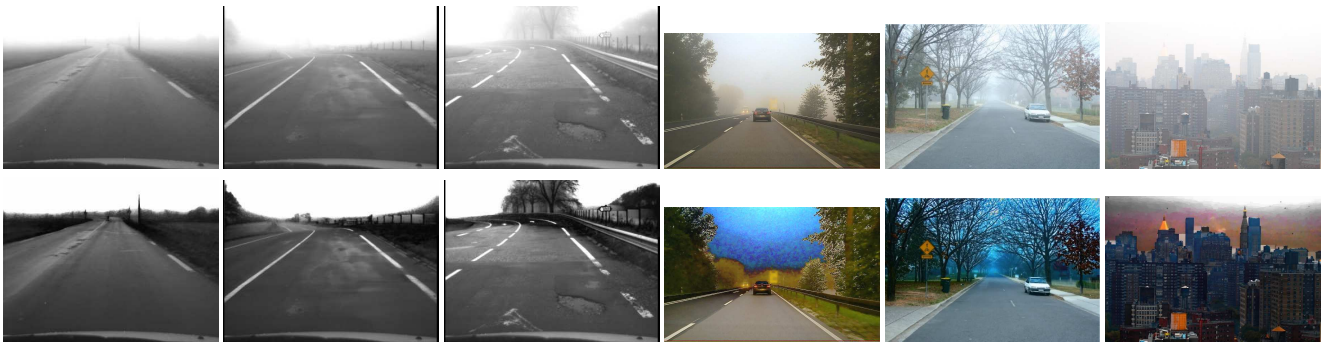
Fig. 4. Result of restoration on camera images. First line, the original image. Second line, the restored image with the proposed MRF based algorithm. The road planar constraint is used only for the 5th first images. Fourth foggy image is courtesy of Audi. Fifth foggy image is courtesy of [8]. Sixth foggy image is courtesy of [5].