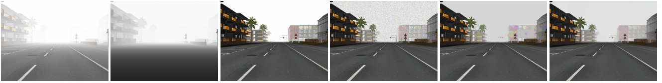
Fig. 2. Comparison of defogging results. From left to right: the input foggy image, the atmospheric veil obtained by minimizing (10), the restoration result without regularization and without noise, the restoration result without regularization and with noise on the input image, previous method with smoothing of the input image, our restoration result.

how dark or light are the gray areas in the result image. We usually set its value as a percentage of I_s , for instance I_0^b = 0.25I_s .