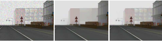
Fig. 1. Effect of the prior term E_{prior-I_0} . From left to right: without regularization i.e. \lambda_{I_0} = 0 , when \lambda_{I_0} = 2 and without exponential decay, when \lambda_{I_0} = 2 and with exponential decay.

spreads on remote objects. With the prior with exponential decay, the smoothing effect is homogeneous with the distance and small details are kept even on remote objects.