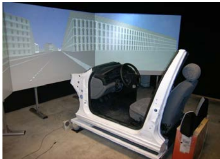
Figure 1. Driving simulator

The experiment was carried out on the SIM 2 -IFSTTAR fixed-base driving simulator equipped with an ARCHISIM object database (Espié, Gauriat & Duraz, 2005). The driving station comprised one quarter of a vehicle (see Figure 1). The image projection (30 Hz) surface filled an angular opening that spanned 150° horizontally and 40° vertically. The vehicle had an automatic gearbox and was not equipped with rearview mirrors.