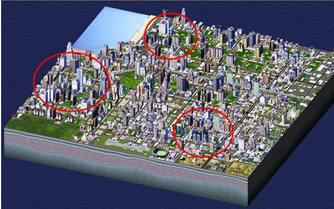
Fig. 8: Polycentric space in SimCity 4 (2003).

Conversely, in SimCity , the measure of distance is tied to amenities. During the game, interactions between land zoning (housing, industrial, and commercial) and distance to amenities and services first generate concentric urban areas, as in the Burgess model. Depending on its level of development, the city can then be structured in multiple kernels, as in the model of Harris and Ullmann, and some edges-cities may emerge (Fig. 8).