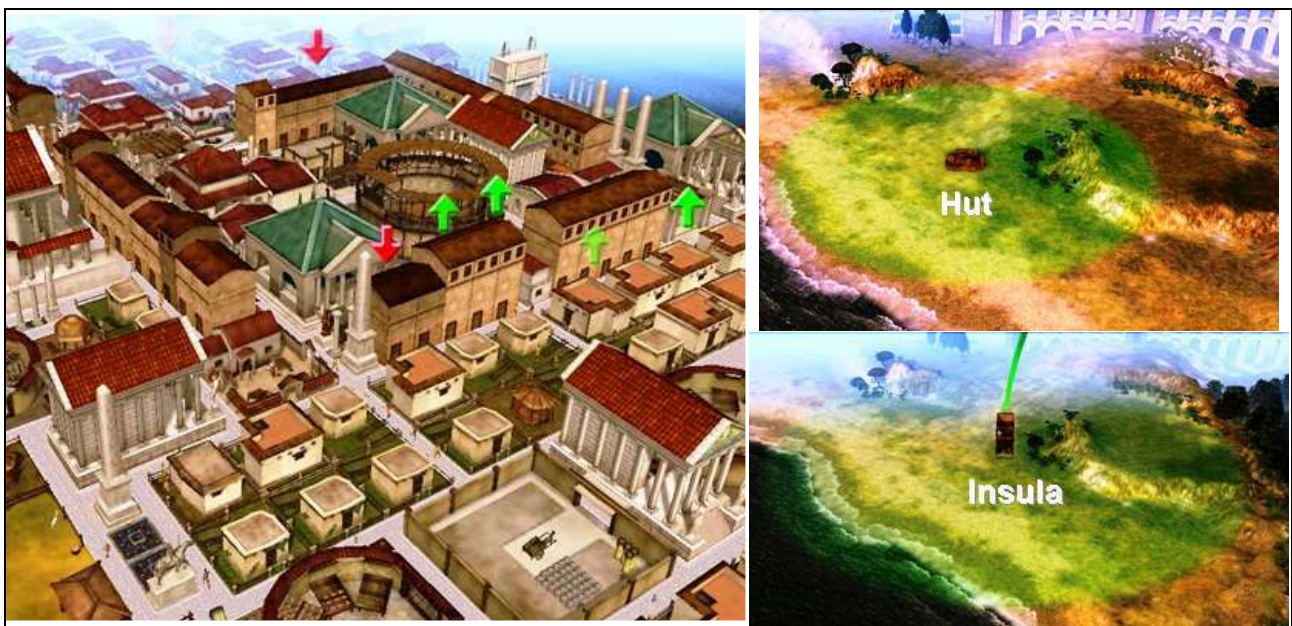
Fig. 6: Centralized urban space in CivCity Rome (2006). Dwellings near the equipments concentrated in the centre upgrade (left), and the better a house is, the further its residents can travel to catch products and services (right).

the social ladder, which is graphically shown by the improvement of their dwelling. This improvement is also rewarded by an increase in local taxes levied; they will directly feed public funds and hence increase the player's options. Like in City Life , product availability and services proximity depend on the accessibility of catchment areas (mainly markets) or equipment, measured by Euclidian distance and by the presence of roads. In order to get the most cost-effective outcomes and faster development, the player needs to favour neighbourhoods where the first signs of quality emerge. In CivCity Rome , the distance is tied to dwelling: the better a house is, the further its residents can travel to obtain products and services (Fig.6), thus accessing more diversity and increasing their chances to upgrade again. This creates a positive feedback loop: the presence of a wealthy population encourages demand in higher level amenities and products, to which the player responds by developing them, in turn consolidating the emergence of wealthy neighbourhoods, all increasing financial revenues and player possibilities. A centralized urban area emerges, because regulations make the player concentrate its efforts in areas that are already well equipped and supplied (Fig.6), especially since the game allows the player to move houses to the best equipped neighbourhoods.