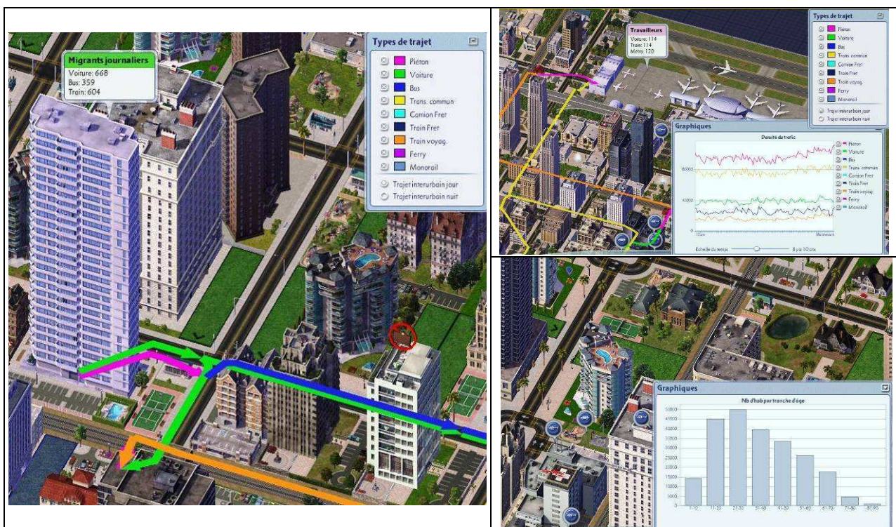
Fig. 2: Diagnostic tools in SimCity 4 (2003)

Finally, video games such as SimCity enable simultaneous viewing or overlay of diagnostic tools (maps, graphics, etc.) offering significant amounts of information. In SimCity 4 , it is possible to overlay arrows showing real-time traffic, route, and transport modes. The player is therefore led to use GIS-like tools to read urban processes and assess its choices regarding the model outcomes (Fig. 2).