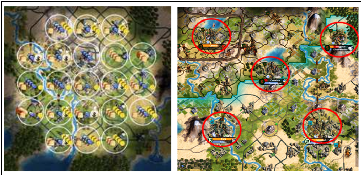
Fig. 5: Cities' network in Civilization IV (2006). Each city controls a 21 cells production area (left), the model and regulations lead the player to specialise cities and to create a hierarchical cities' network (right).

Moreover, it is possible to place the national stock exchange in the smallest city, but this is utterly counterproductive. It is better to build it in the wealthiest city in order to maximize funds and use them to develop other cities.