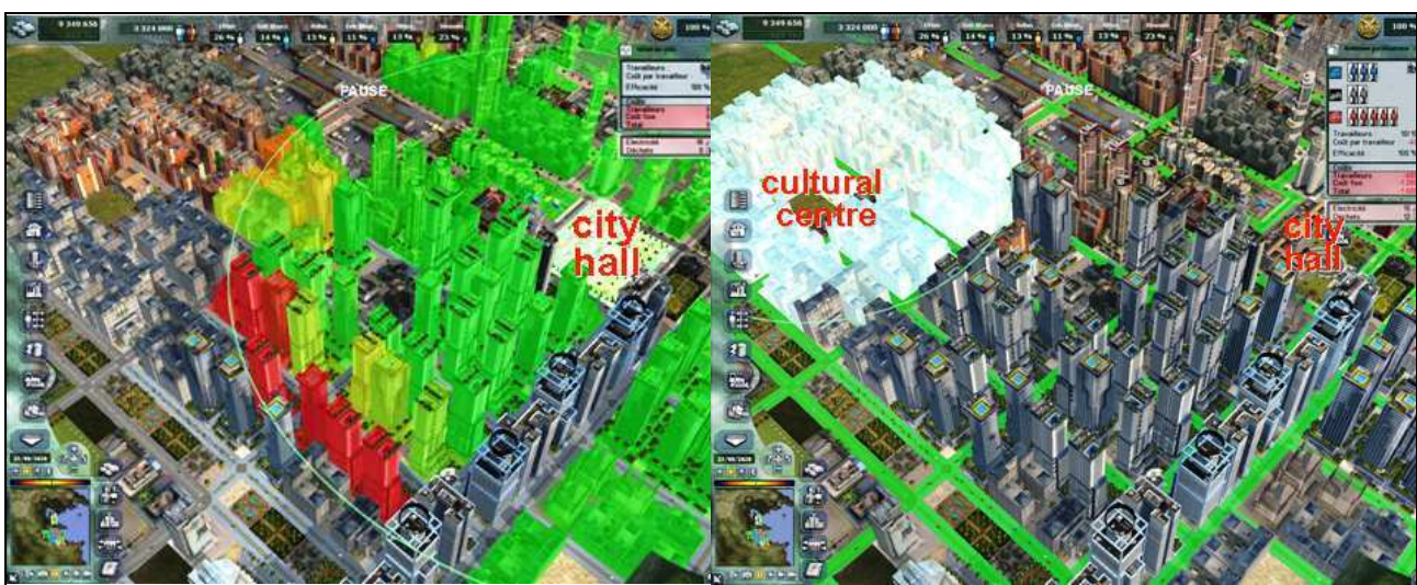
Fig. 7: Hierarchical urban space in City Life (2006). Dense and diverse central area around the city hall (left) and smaller centrality spot around the nearby “cultural” centre (right).

In City Life , a few settings are enough to model from a blank game map a city with socially differentiated neighbourhoods, sometimes separated by buffer zones, and with a central area concentrating social diversity. The game is based on a subtle balance between spatial proximity and urban segregation to ensure both proximity of a diverse labour force for each type of activity and social homogeneity inside each neighbourhood. The emerging organisation stems from the definition of centrality as both a dense and socially diverse area' this diversity can only exist around specific equipments: city hall and cultural centres. The cultural or neighbourhood centres have a smaller effect radius than the city hall, which is always the first building to be found. The result is a city polarized by a few hierarchized centralities, ensuring density and diversity, at the fringe of the homogeneous zones (Fig.7).