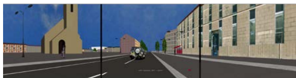
Fig. 1. Overtaking scenario.

Station scenario: a vehicle driving in the opposite lane suddenly turns left in front of the participant.