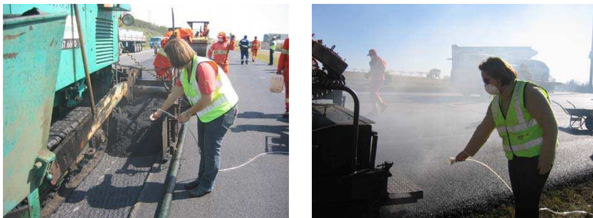
Figure 2: Reduction in visible emissions when paving WMA (left) and HMA (right)