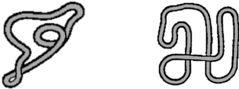
Figure 2. The skyline track on the left, snowmountain on the right.

At last, we obtained a 120 examples set containing game statistics distributed between 14 different subjects (in order to avoid subject-specific results) with various blood alcohol content, between 0 and 1 g/l. We ensured that, after the experiment, no subject drove a real car while having a blood alcohol content superior to 0 g/l.