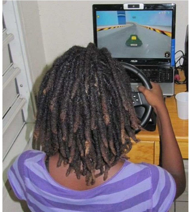
Figure 1. The prototype during a run

For each full lap of the circuit, a vector of 5 components is preserved and will feed the artificial neural network. Those components are (i) the average number of steps per rotation (the steering wheel is analogical), (ii) the number of accidents (collisions and falls), (iii) the total number of actions of the steering wheel, and (iv) the number of changes in direction (e.g., the driver was turning left and is